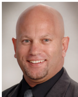
By Brian Jakins Regional Vice President, Africa Sales

Nations across the expansive Africa region are making plans to switch to Digital Terrestrial Television (DTT), and for good reason. Digital signals provide improved reception quality and enable the delivery of expanded channel lineups and enhanced multimedia applications, such as video-on-demand and entertainment services. Switching from analog to DTT signals also allows for the more efficient use of spectrum, as frequencies formerly used by analog broadcasts can be repurposed for wireless networks that can contribute to national economic growth. But before a nation or license holder decides on an implementation strategy for DTT, they must consider three questions.